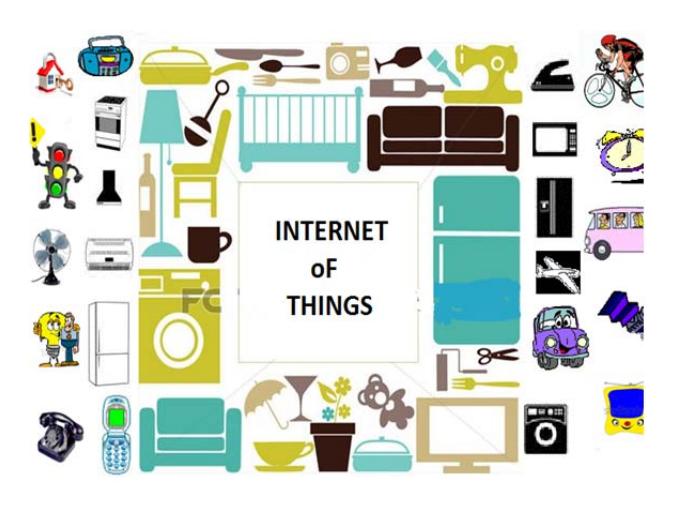
Fig. 1 Overview of Internet of Things